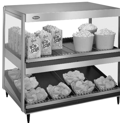
Model GRSDS/H-36D with slant base and horizontal top shelf and optional 15" (381 mm) clearance top shelf