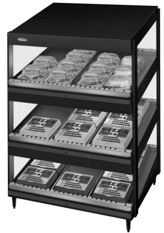
Model GRSDS-24T triple slant shelf in optional Designer black